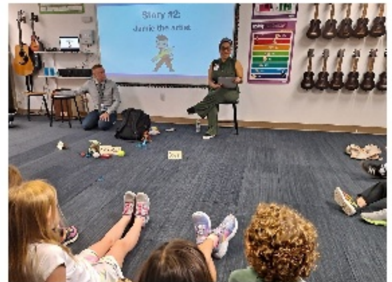
Trevor Day School K12 all grade level class presentations in New York, NY.