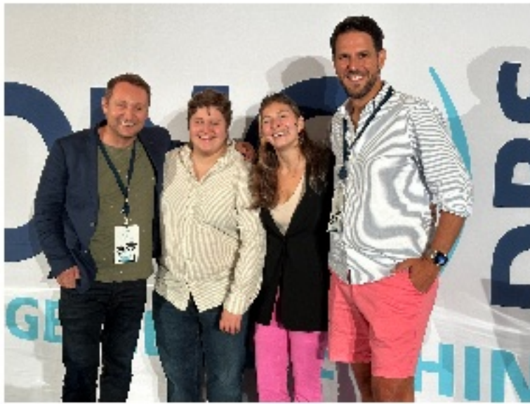
Danone Miami leaders with YES Institute education team members.

From global corporate conference workshops to local business trainings, our team is digging deep into inclusion, belonging, and psychological safety in the workplace.