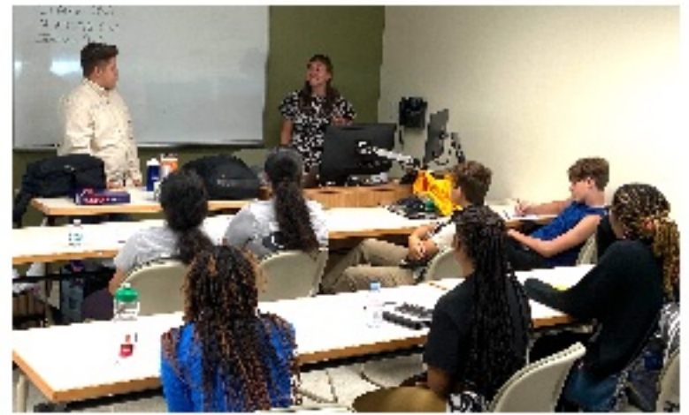
University of Miami First Star Academy for high school students.

“I realized that I shouldn’t be afraid to open up and reach out when I’m feeling stressed. There’s always someone I can talk to and there’s an amazing community at YES Institute!” –Youth leader