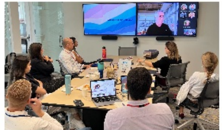
SAP Miami with YES Institute.