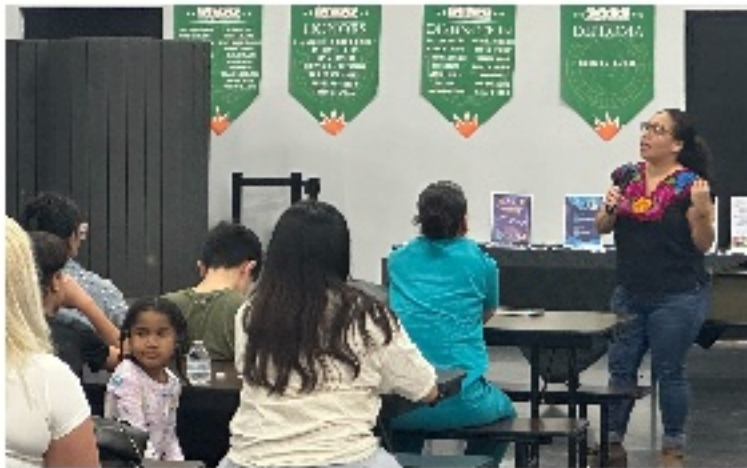
Pinecrest Preparatory Academy Middle & High School Mental Health Fair.