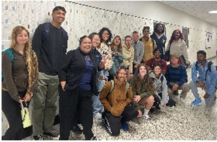
St. Thomas University health psychology class.