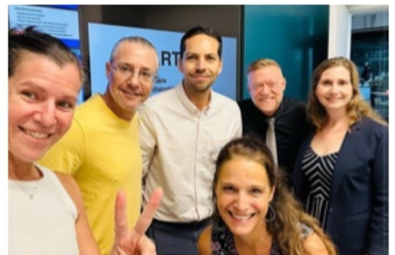
Kindness Matters 365 nonprofit leaders.