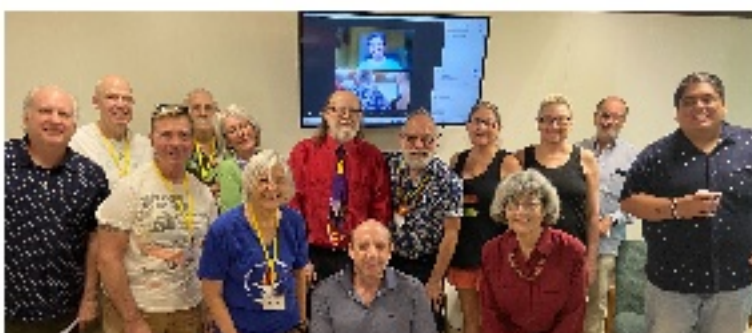
Unitarian Universalist Congregation of Miami Social Justice Committee.

“Today we learned about gender concepts and about some of the ways that sexism impacts everyday life. It was really interesting to get to hear other people share experiences that were either similar to mine or dramatically different.”