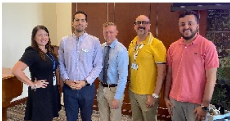
Hospitality professionals attending Greater Miami Convention & Visitors Bureau and YES Institute training.

Designed for multiple levels of hospitality professionals, the “LGBTQ+ Sensitivity & Awareness” training offers best practices for welcoming and including lesbian, gay, bisexual, transgender, and gender nonbinary visitors, and their families, to the Miami region. For more information, email us: info@yesinstitute.org