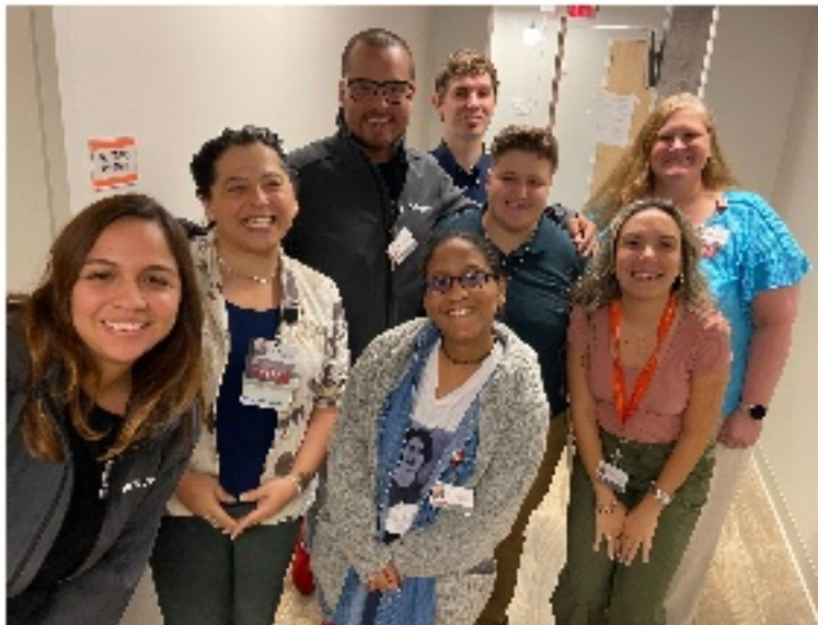
Care Resource healthcare center.

"You all are a Godsend, it's hard to find organizations like yours in Florida." –Therapist call seeking medical resources for their client after attending a training at YES Institute