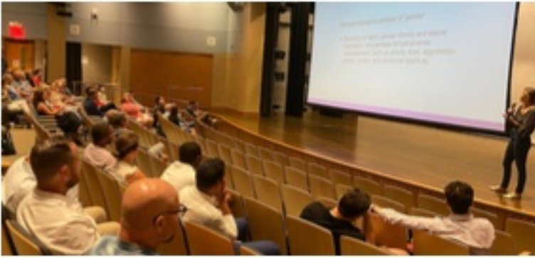
Trevor Day School K12 faculty and staff training in New York, NY.