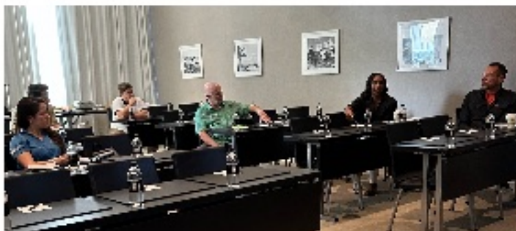
AC Hotel Miami Beach, a Marriott property, hosted “Miami Begins with Me” LGBTQ+ Sensitivity & Awareness training conducted by YES Institute.