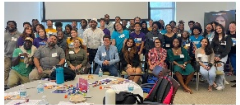
Breakthrough Miami Schools & Mosaic Miami Panel on inclusion.