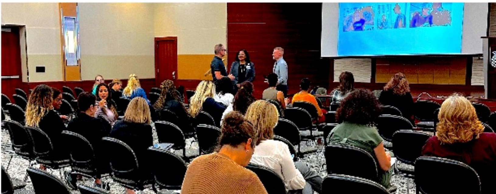
Baptist Health South Florida South Miami Hospital clinical CE leadership presentation.

–Baptist Health South Florida South Miami Hospital Leadership team member