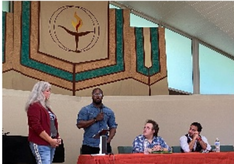
Unitarian Universalist Congregation panel on gender and faith.