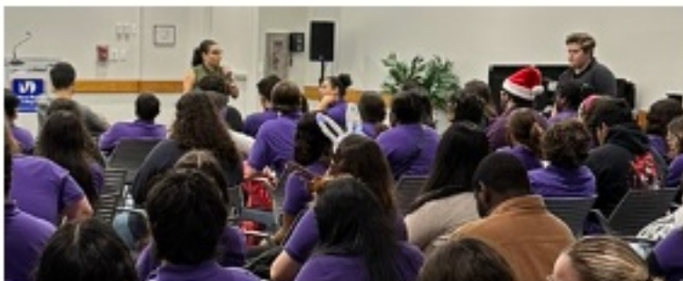
Miami Dade College Honors Program.