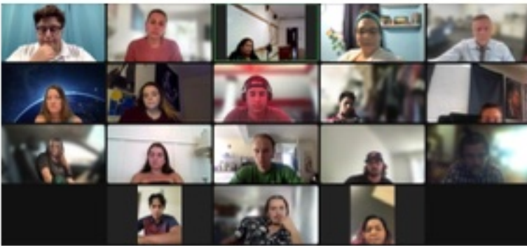
University of Hawaii undergrad class.