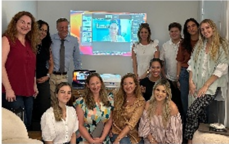
South Miami Psychology Group.