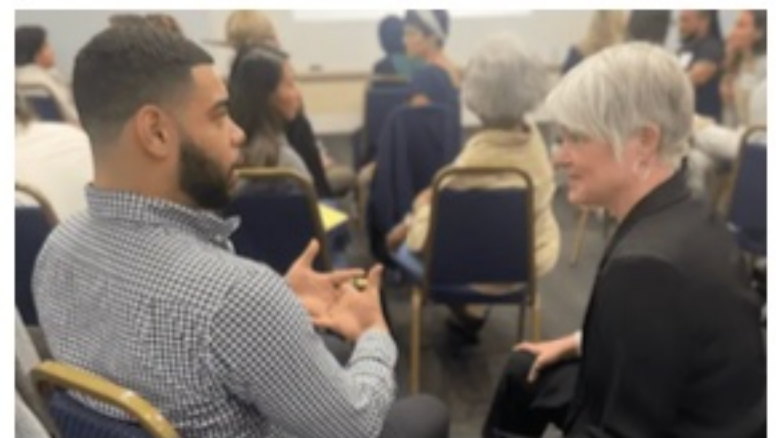
Attendees practicing listening skills.

“I’ve been arguing with people who may just want to be heard. I’m definitely going to work on being with others authentically, acknowledging their points, and give the gift of generosity.” –Participant