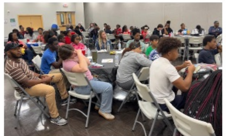
Urban League of Broward County Teen Conference on bullying prevention.