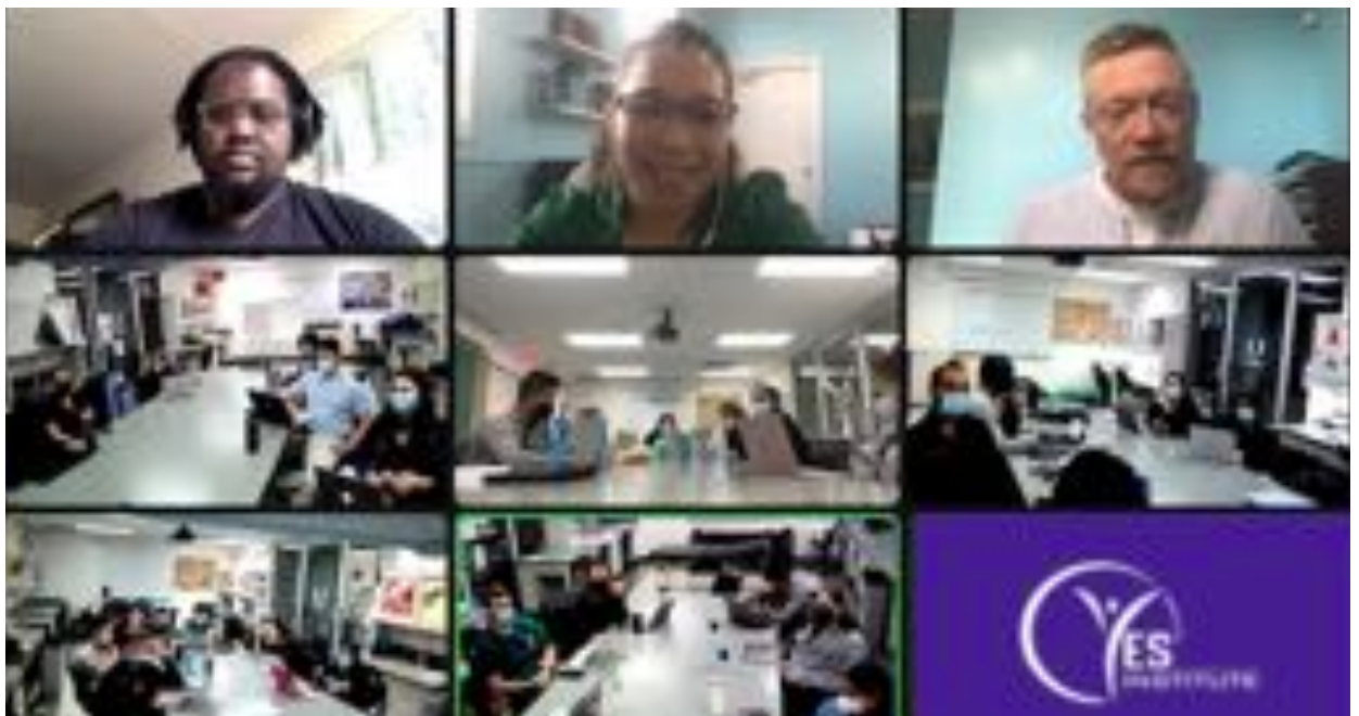
YES Institute with University of Miami Miller School of Medicine students.