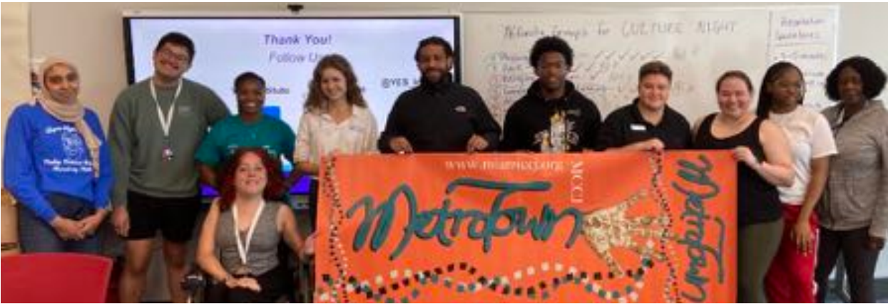
MCCJ MetroTown youth summer program with YES Institute facilitators.

YES Institute's model of communication is interwoven throughout all our work, allowing diverse participant perspectives to be shared and included in open and authentic conversations.