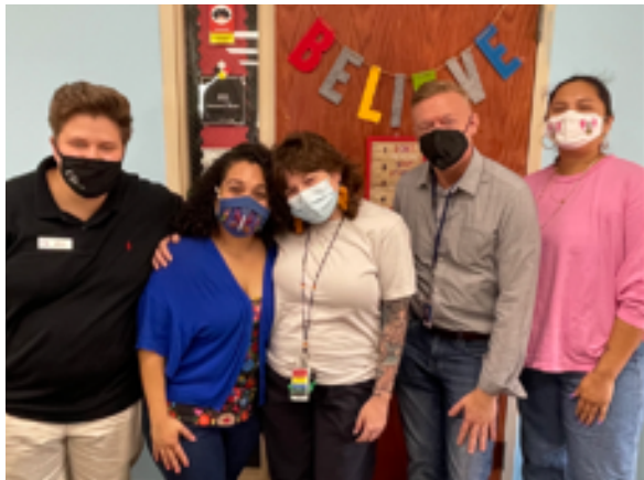
Miccosukee Indian School counselors and faculty.

“I learned how to better support youth in my therapy sessions.” – FIU psychology student