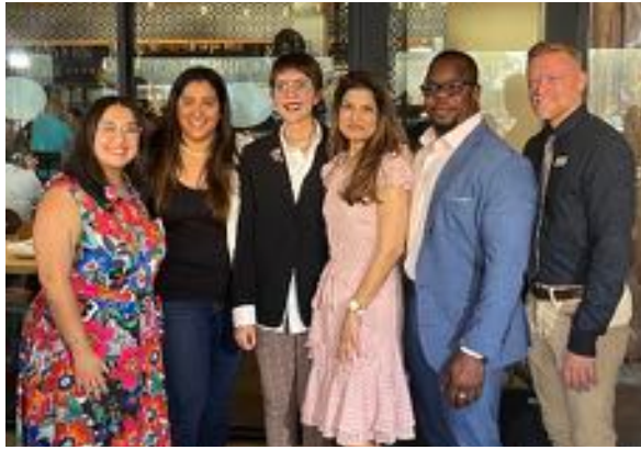
Buxani Counseling Care event for Mental Health Awareness on behalf of youth in the pride community.

“I learned how to better support youth in my therapy sessions.” – FIU psychology student