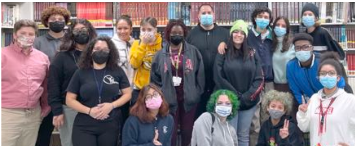
YES Institute with students at Killian Senior High School in Miami-Dade.

“We learned awareness of just how much our kids are struggling and dealing with in today’s time, as opposed to our time growing up as children.” – Broward County Public Schools Equity Summit participant