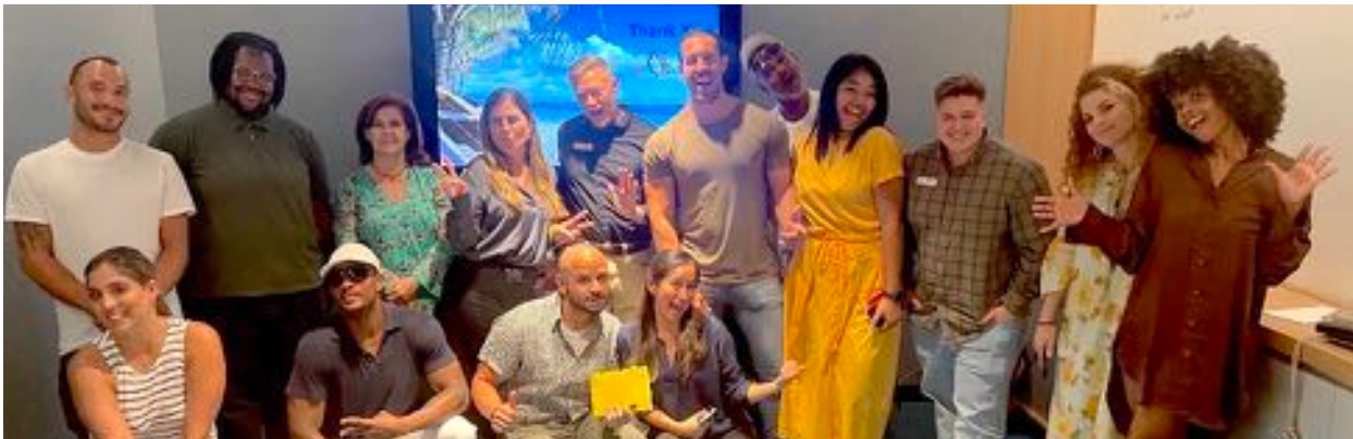
Staff from The Standard Hotel & Spa with YES Institute education team.