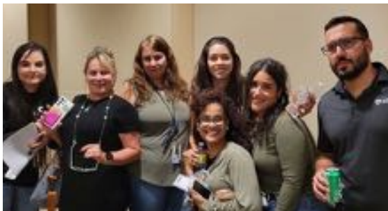
Camillus House case managers and therapists.

St. Timothy's Lutheran Church is creating a welcoming and inviting faith family within the Miami Gardens community. We led two sessions for church leaders, staff, and parishioners to better understand unconscious bias and cultivate welcome and belonging in their congregation.