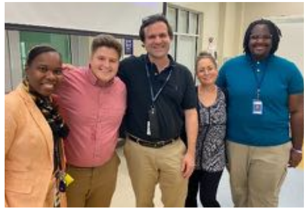
Palmer Trinity Episcopal School faculty with YES Institute.

Our team led a gender and orientation workshop for staff at Camillus House, a Catholic-founded agency that is feeding, clothing, and sheltering 33,000 people annually. Case managers have reported increased housing and food insecurity among gay and transgender youth and adult clients and their families.