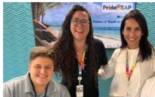
YES Institute with Pride employee affinity group SAP employees.

“Loved seeing the impact of this dialogue on my colleagues! I learned different perspectives about these topics. I truly appreciated the respect and open discussion YES Institute created with us. Highly educational.” – SAP Miami participant