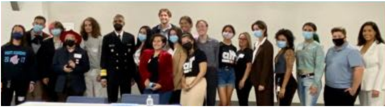
YES Institute youth and community agencies with US Surgeon General Dr. Vivek Murthy.

The Office of the US Surgeon General invited YES Institute youth to a roundtable discussion on youth mental health and gender and orientation topics at Jackson Memorial Hospital in Miami, Florida.