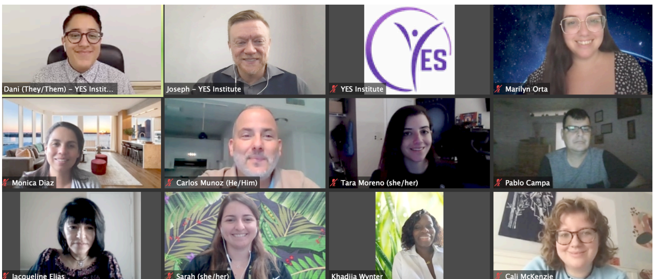
Participants from South Florida and other cities across the US experiencing Communication Toolbox on Zoom.