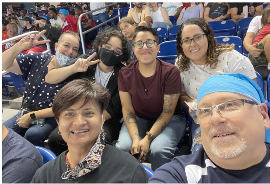
We thank the Miami Marlins for ticket donations for volunteers and staff.