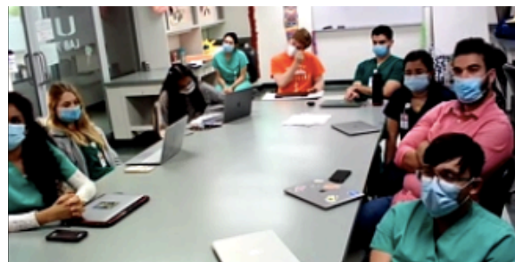
University of Miami Miller School of Medicine students with YES Institute.

We applaud the leadership of Baptist Health South Florida (BHSF), who offered a system-wide YES Institute webinar on transgender awareness, and the nurses at BHSF Bethesda Hospital, hosting a gender and orientation inclusion CE session during National Nurses Week.