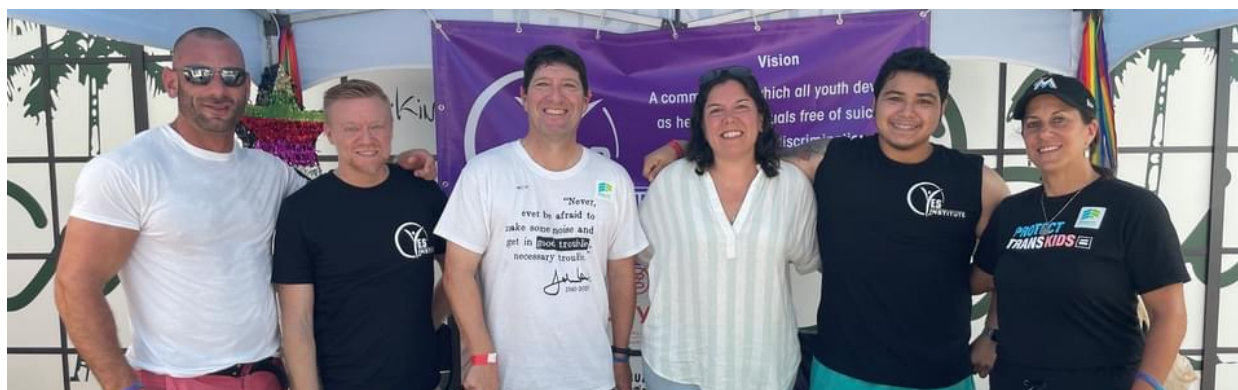
YES Institute board, staff, and YALC graduates at Wynwood Pride community booth.

Details will be forthcoming about an innovative gay and lesbian historical preservation art exhibition project led by our YALC members in collaboration with HistoryMiami Museum and Miami Beach Pride.