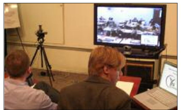
Videoconference with North Georgia College & State University.

An NGCSU administrator commented, “I see how much I stop myself from speaking because I don’t want to say the ‘wrong’ thing when I see harassment at school. We need more effective ways to engage in dialogue to enhance understanding around these topics.” Will the military pursue education to re-examine notions of gender and orientation? We think they might.