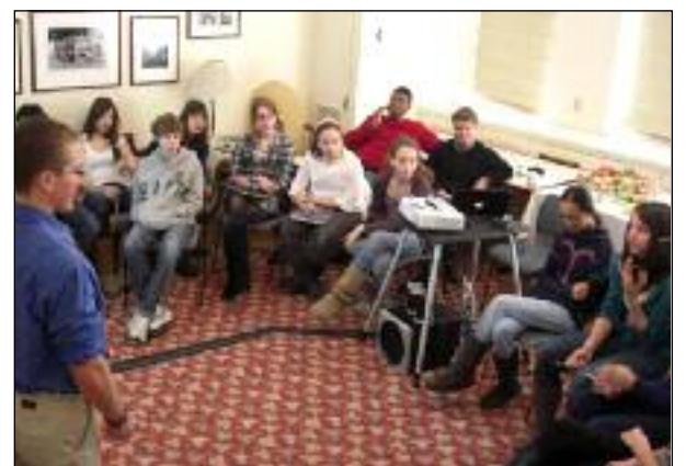
Fieldston students in YES’ Gender Continuum course.