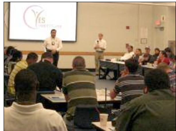
Homestead police in YES dialogue.

"My friend's son just came out as gay. I know he doesn't see me as a safe person in his life, but I'd like to change that." -Homestead police officer