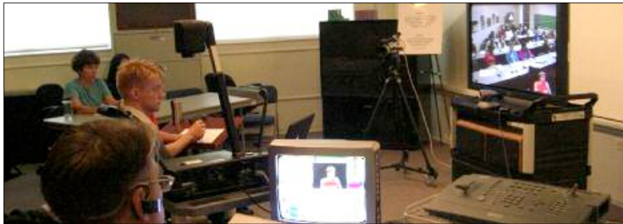
YES staff working with Alabama community leaders via distance learning.

Videoconferencing technology brought 30 Alabama parents, educators, clergy, and community members virtually into our course room to participate in Essentials of Orientation™. Many had never heard the words "gay" or "transgender" in open discourse, and spoke tentatively at first. As the course progressed, people shared from the heart about real situations in their lives. One parent said, "My fifth grade son is tormented with 'faggot' and 'homo' on the bus everyday, but I don't know what to do." Many people expressed their fear that supporting students labeled as gay or transgender conflicts with their religious beliefs.