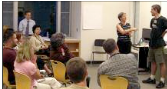
Fieldston faculty engaged in Communication Solutions™.

YES' Gender Continuum course opened parents and teachers to new reflections on the impact of gender on their students. A parent expressed, "Gender is everywhere! Expectations for masculinity and femininity surround us at every moment, yet we are virtually silent on this topic at school. Every Fieldston student should see this course."