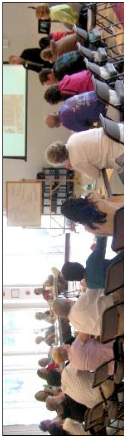
Faculty at St. Andrew's Episcopal School engaged in discussion about gender and orientation.

Unexamined beliefs about gender and orientation limit the freedom kids have to express themselves. We ask, “Are you gay or straight?” as if the answer tells us who someone really is. The set of expectations and meanings accompanying these words makes the labels toxic. YES educational courses reached 400 teachers and students last month, giving participants access to seeing past