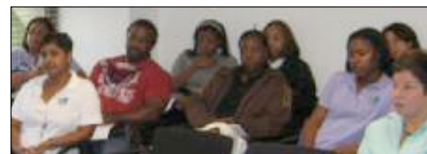
JAC staff in a YES Institute training.

YES Institute led a series of trainings at the Juvenile Assessment Center (JAC) for case managers and staff, who serve youth arrested in Miami-Dade County.