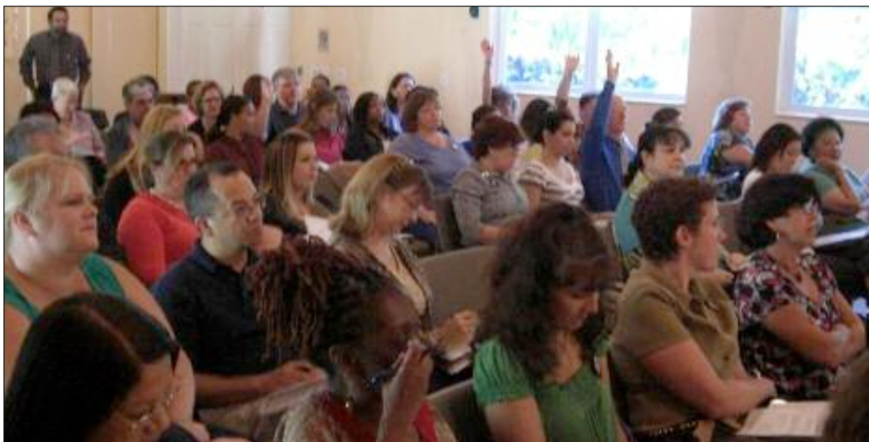
Miami-Dade teachers and counselors at YES Institute.

Students who struggle with gender identity face a day-to-day reality that is very difficult, and often life-threatening. Thirty-two percent of youth labeled as "transgender" attempt suicide, and 60% are attacked in violent assaults. Last month, 100 Miami-Dade County Public School teachers and counselors met at YES Institute, and spoke of the increasing visibility of gender transitions.