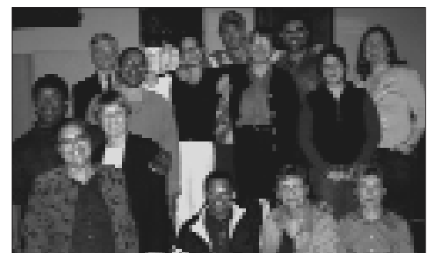
Youth advocates, therapists, parents, and clergy in Wilmington, DE.

The Essentials of Orientation workshop was presented twice, at an evening session in Wilmington Nov. 15 and again in Dover the next afternoon. (See “Delaware” on page 2)