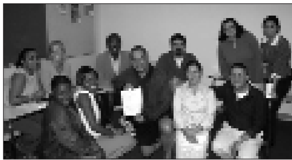
St. Thomas University graduate counseling students.

From community colleges to Ivy League universities, the YES Institute continues to spread its message on gender issues and awareness to those who work with - or will work with - youth. Recently our work reached over 80 college orientation directors and graduate counseling classes at three major Miami-area universities.