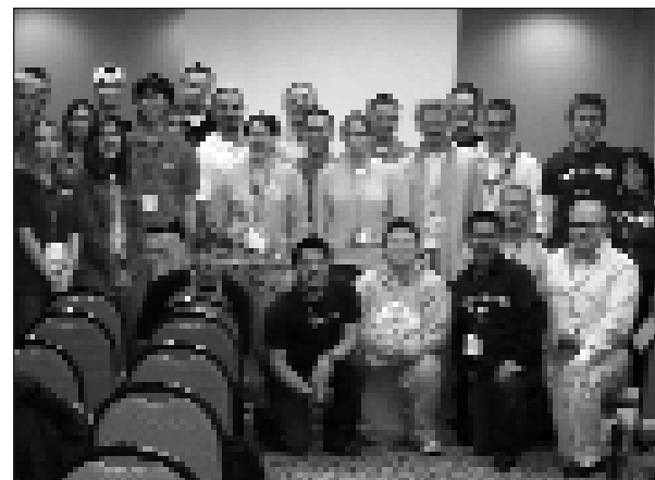
NODA Gay & Lesbian Caucus at Hotel Intercontinental, Miami, FL.

were exposed to YES Institute techniques at University of Miami, St. Thomas University, and Carlos Albizu University.