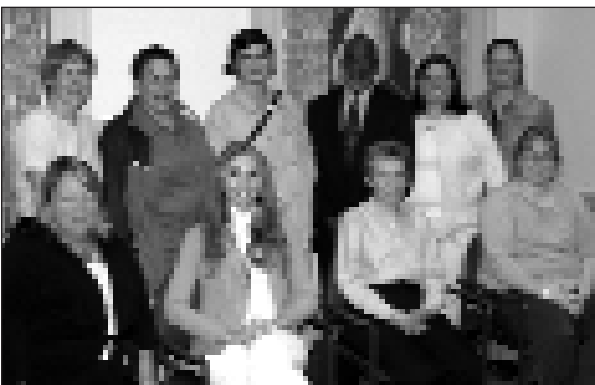
Counselors and child welfare workers in Dover, DE.