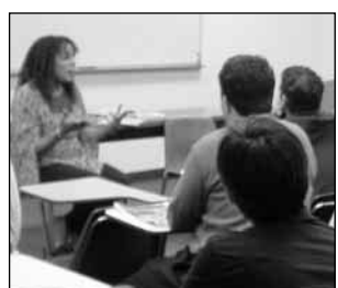
FIU students engage in discussion.

Transgender is a hot topic in classrooms, evidenced by increasing references in pop culture and television. Students are requesting more opportunities to engage in academic discussions about transgender.