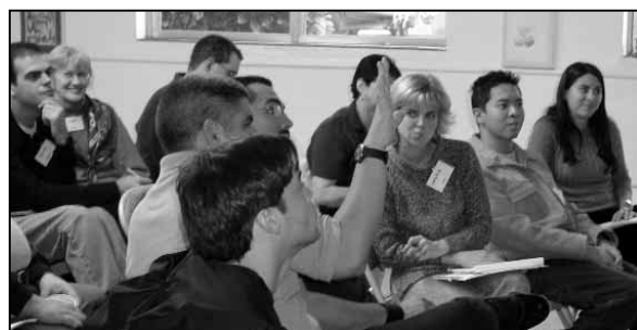
Future leaders at Project YES.

Participants from across the United States – Dallas, New York, San Francisco, West Palm Beach, and Fort Lauderdale – including nurses, professors, pharmacists, clinical psychologists, actors, clergy, and youth, experienced our Communication Solutions course this December.