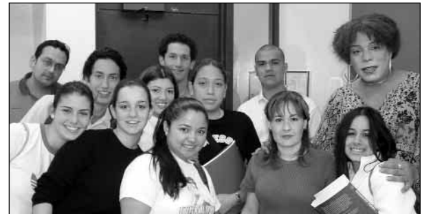
MDC students learn to distinguish orientation from gender.