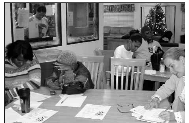
Youth leaders in action at Miami Bridge.

If you are interested in having a dialogue on this topic in your place of worship, please contact Project YES at 305-663-7795 .