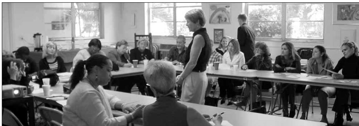
Over 40 counselors attended the gender preview.

Learning about intersex and transgender topics sparked new conversations and terrific dialogue. We saw the commitment of these professionals to the youth in their care and were impressed with the extra effort they took to broaden their understanding and obtain new information.