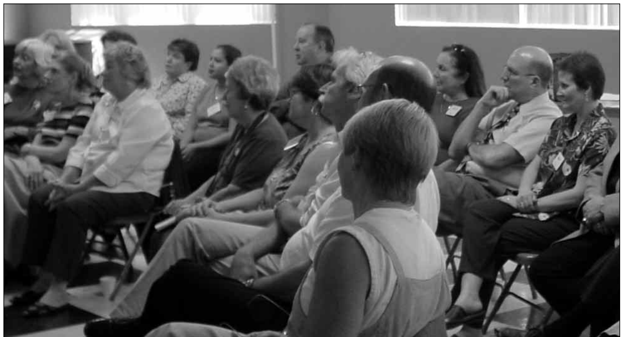
Over 30 clergy and archdiocese attended the Communication Solutions course.

This outstanding team demonstrated their commitment to leadership by taking on new ways of communicating, working diligently on the unfamiliar, and accepting each challenge presented. Their willingness to reach and