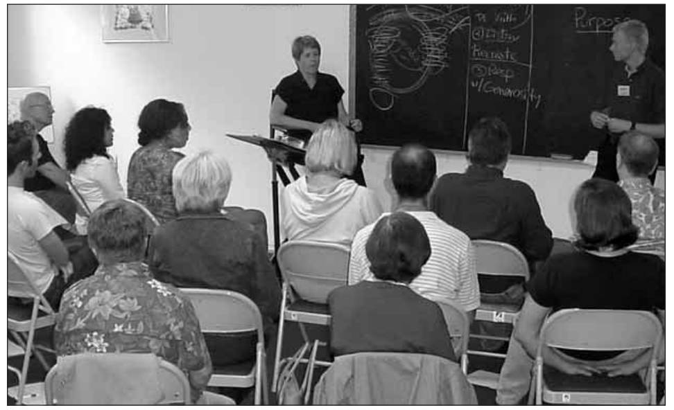
Participants at the November Communication Course.

Speaking from the heart, passionately exposing me in the context of the message, will captivate an