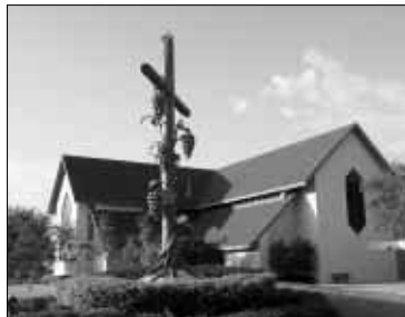
St. Luke's United Methodist Church.

and numerous clergy and religious leaders. The workshop began with strong voices articulating their commitment to creating safe environments for all youth in Central Florida.