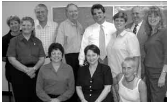
Some Central Florida YES members.

Having that focus, participants eagerly practiced new skills in communication to use in beginning their work for youth and families in Central Florida.