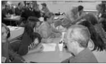
Course exercise during the first day.

“ Absolutely made a difference for me... I would like to be part of the dynamic energy of this organization. ”