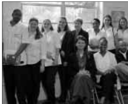
Nursing students from Barry University.