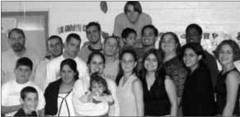
Palm Springs Presbyterian Youth Group (above) generously donated $700 to Project YES. South Florida Tennis Club also contributed $700. We thank both supporters for their partnership.