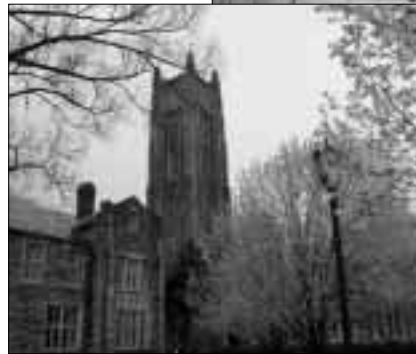
On the campus of Scarritt-Bennett, retreat center in Nashville, Tennessee.