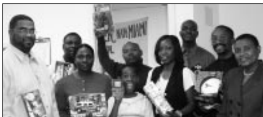
Staff of Fanm Ayisyen Nan Miyami (Haitian Women of Miami).

Embracing the spirit of giving, Project YES directed a donation of toys from the Fort Lauderdale Gays and Lesbians Offering Warmth (GLOW) Project to our valued community partner, Fanm Ayisyen Nan Miyami (Haitian Women of Miami).