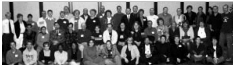
Participants of the 2-day Communication Course in Detroit, MI.