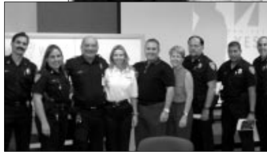
Miami Beach Police officers at Project YES workshop