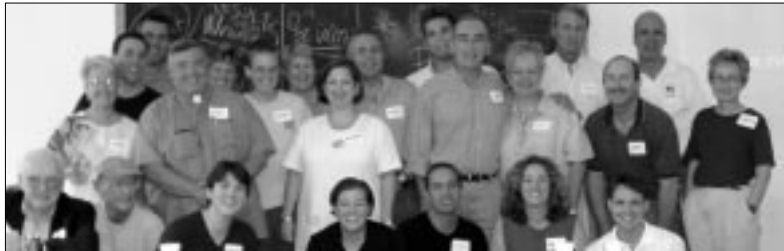
Participants at the July Communication Course

Twenty new speakers completed the Project YES communication course in July. I had the chance to participate as a workshop leader-in-training. This course was one of the most inspiring things I have witnessed at Project YES. I am now more excited than ever about being a course leader.