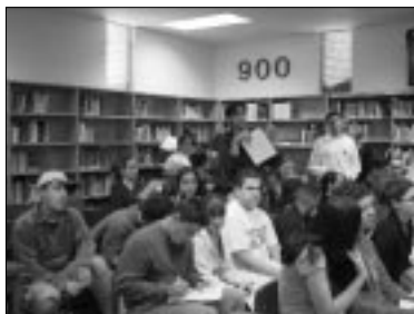
Students at Southwest Senior High School

If you happen to run into a Miami-Dade Public School Counselor, give them a hug. They'll smile, and understand why. The student to counselor ratio is currently 4000:1. With so many different problems our young people face today, the job of a counselor is simply gargantuan.