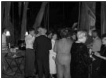
The Wonderland setting