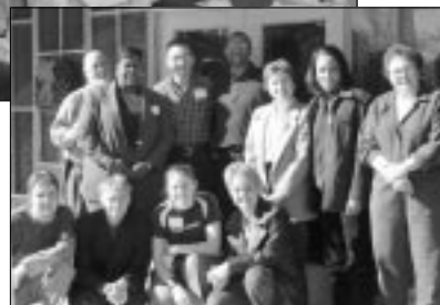
Faculty members and department heads at NGCSU