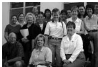
Project YES Communication Course participants

The next course will be February 24 and 25. If you want to improve your communication skills, want to make a difference for gay and lesbian youth, are afraid of public speaking, or are a seasoned public speaker, this course is for you! Sign up today by calling 305-663-7195. Registration fee is $50 for adults; $15 for students under 21.