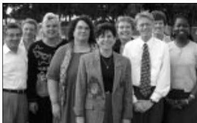
One of the four groups of Elementary Counselors trained by Project YES

Diversity, and the A.D. Henderson Foundation for working in partnership to make the vision of safety for all students and families a reality in South Florida.