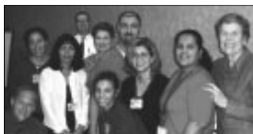
Hospital staff workers at the training

"This information will be extremely helpful when working with children and adolescents who are struggling with their identity. I feel I am now better equipped to handle questions pertaining to gender and identity."