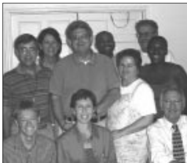
Participants of the SFCFTS workshop at Project YES

Asking for such respect for myself, can I so offer such respect to another? Out of such respect grows communication, and finally, community. This kind of experience is a rare and precious gift. I give thanks for this time of being together, recreating, and generosity, that I experienced for a few moments on this day of communication."