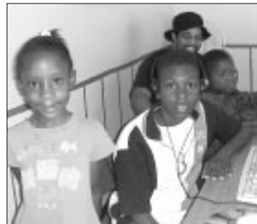
Meet the Town Park kids!

They must learn to carefully share one internet line and 6 Pentium computers that were donated to the Center. They are in need of more high-end computers, software (especially educational or edutainment packages) and transportation for the youth.