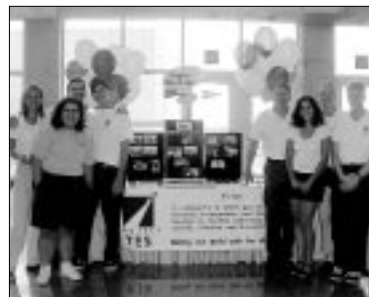
Project YES volunteers catch Sol fever and lend a hand at our table.

We were excited when our partnership began with the Miami Sol. So far, the new WNBA hometown team has had a phenomenal opening season (9-15), currently ranking sixth in the country. The Miami Sol has developed into an opportunity for Project YES beyond our expectations. At five home games, announcements were made referring game-goers to the Project YES table. We distributed information, stickers, and posters to hundreds of fans. It was almost surreal to walk around the American Airlines Arena during intermission and watch scores of people sporting Project YES stickers, t-shirts and posters. This enables us to