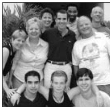
Graduates of the June Communication Course.

that day, an indescribable peace overcame me. I felt a sense of belonging, one that I had never experienced before. Here, I was able to be me.