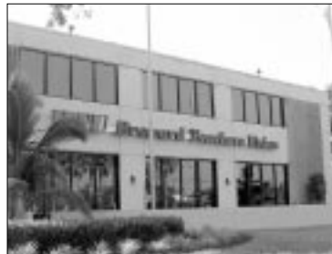
The Broward Teacher Union building was an ideal location for the workshop.

with no resources. They began strategizing ways in which they could begin the conversation in Haiti's Schools and asked if we would consider bringing a presentation to the Haitian Community in Port au Prince.