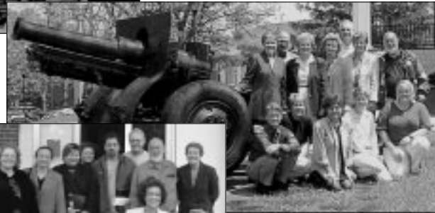
Teachers who participated in SSHF workshop day one.