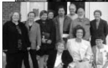
Teachers who participated in SSHF workshop day two.

The first day, we conducted a communication course and clergy dialogue for 12 members of the local rural churches of Dahlonega. They had no idea what to expect as the day began, and their courage was only rewarded with some very difficult work.