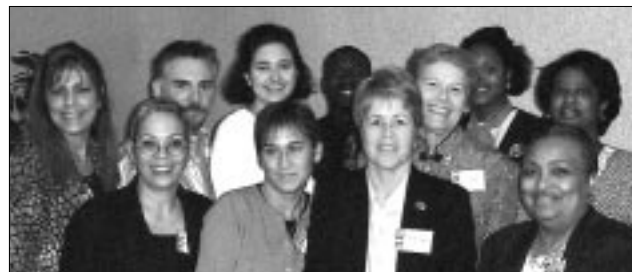
Multicultural education advocates who attended the Project YES workshop.

information about how to appropriately handle other students who may be harassing their