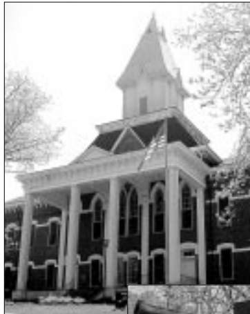
The North Georgia State College and University Administration Building