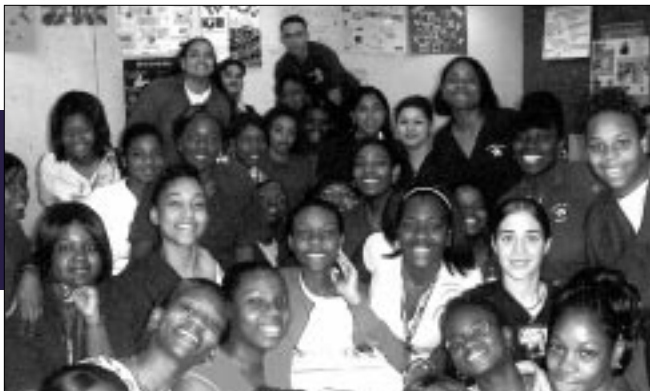
Students at Turner Tech High School