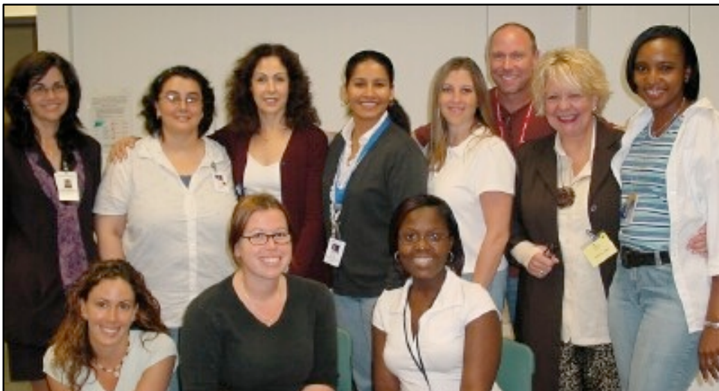
Clinicians, nurses and health care employees with YES Institute at Children's Diagnostic & Treatment Center, Ft. Lauderdale, FL

To register online, go to http://education.yesinstitute.org/portal