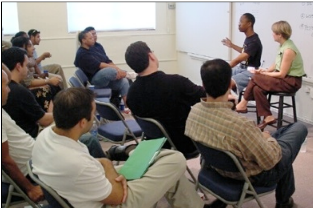
Participants at the Communication Solutions Course, November 2004.

To register online, go to http://education.yesinstitute.org/portal